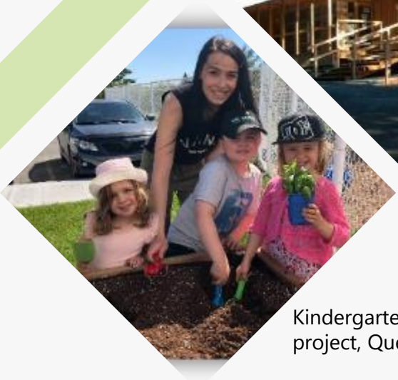
Kindergarten gardening project, Quebec