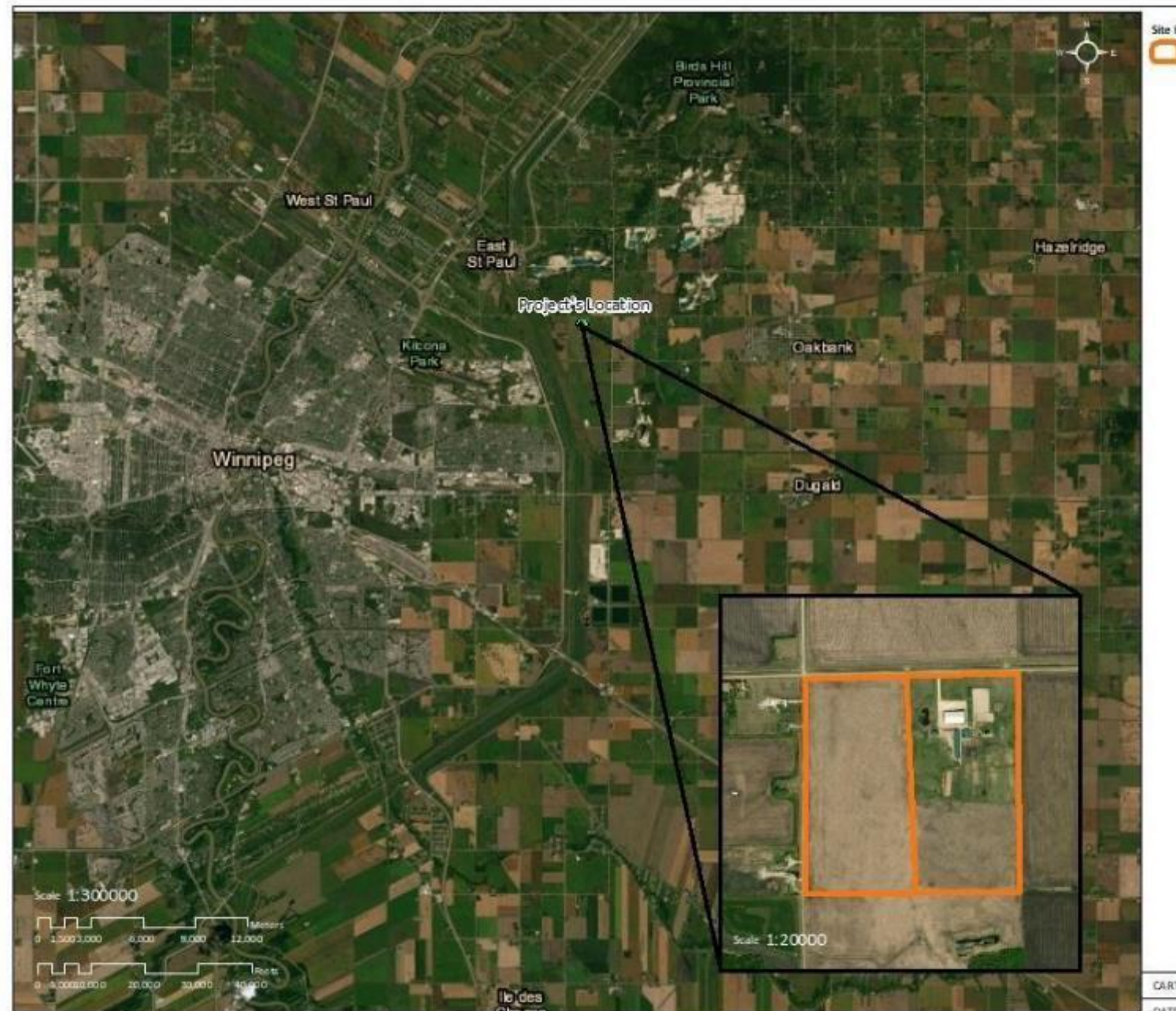
Figure 1 : Project Localisation |